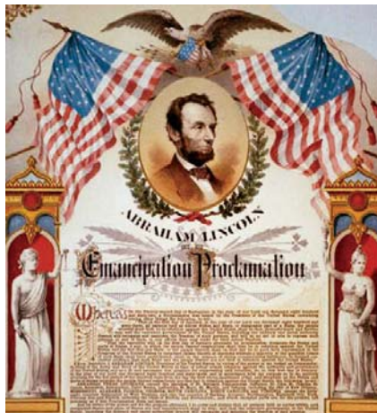
1863 Emancipation Proclamation

"All persons held as slaves are, and henceforward shall be free"